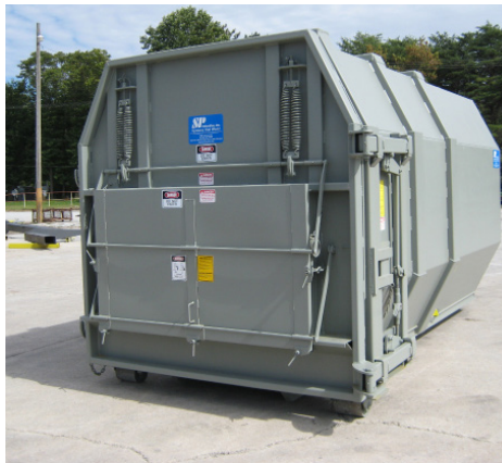
Vertical Lift Door Closed