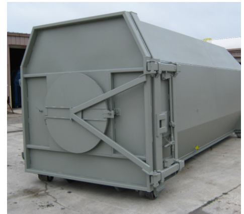
Auger Type Door with Closure Door

CAUTION: This Equipment Should be Operated by Properly Trained Personnel. Improper Use, Misuse or Lack of Maintenance Could Cause Injury to Persons or Property. Photos used in this brochure are illustrative only. We reserve the right to make changes at any time without notice. Information contained within this literature is believed to be the most accurate available at the time of printing.