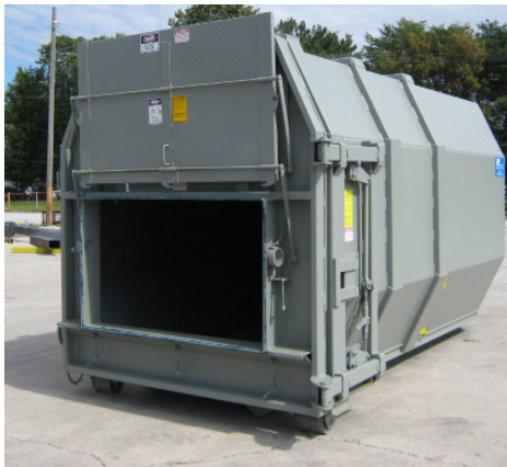
Vertical Lift Door Open