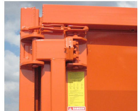
Optional Patented Articulating Hinge for Gasketed Door