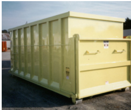
Special Top Hinge Tailgate