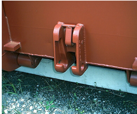
HH Knuckle Receiver