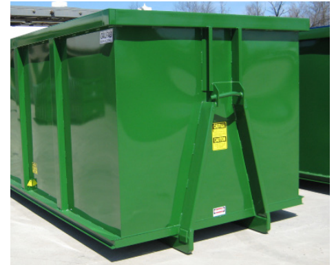
A-Frame for Hooklift