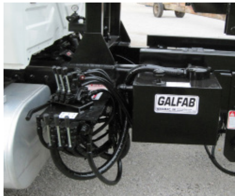
Valve Bank with Mounting Plate and Tarp Controls