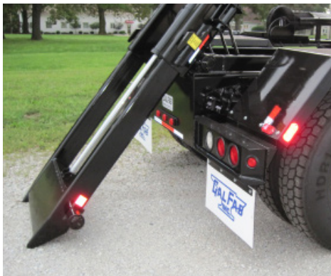
Tail to Ground with Side Roller