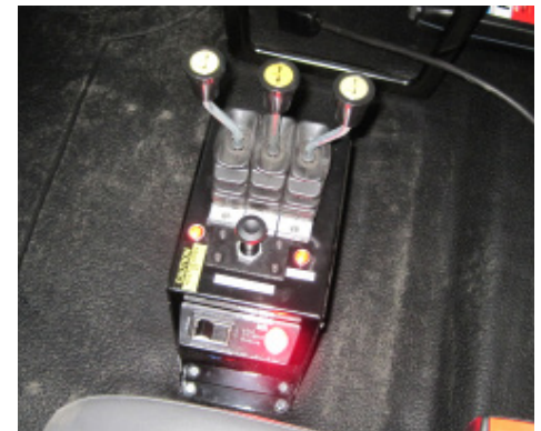
3 Spool Inside Controls