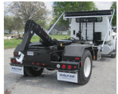
Steel Fenders with Tarp System Option