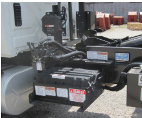
Outside Controls and Reservoir