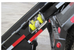
"The Hooker" Securement System at Rear Hinge