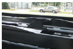
Dempster Stop and Hold On