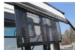
Window Screen Mounted to Tarp System Gantry