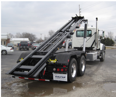
Cable & Hook Hoists

The Hooker is compatible with Galfab's entire line of hoists, containers and trailers.